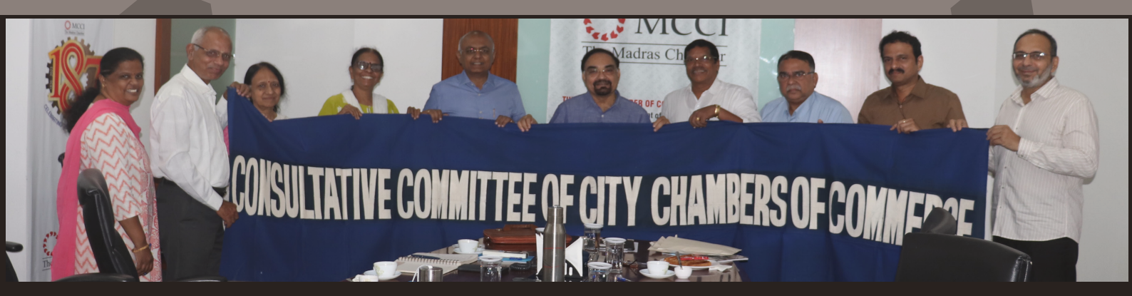
Tamil Chamber of Commerce handed over the Chairmanship to The Madras Chamber of Commerce & Industry